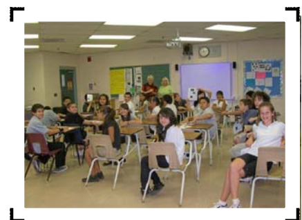
(7th graders at Pistor Middle School participate in a Q&A session with CdIG volunteers.)

Another thank-you goes out to Casa Hill Country Day School Kindergarteners who are busy collecting donations for our cats during their community outreach program. They have also made kitty toys that our cats will receive during the holiday season.